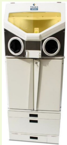
Shielded hot cell for radiochemistry ( Trasis ) ^{18}\text{F} , ^{64}\text{Cu} , ^{89}\text{Zr} , ^{68}\text{Ga} , ^{11}\text{C}