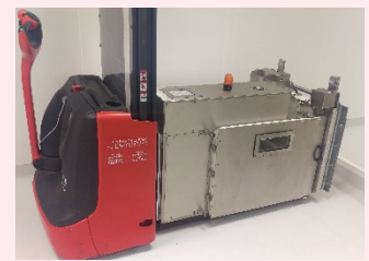
Shielded transportation box for PNH