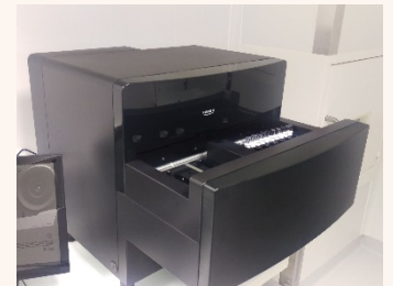
Gamma Counter ( Hidex )